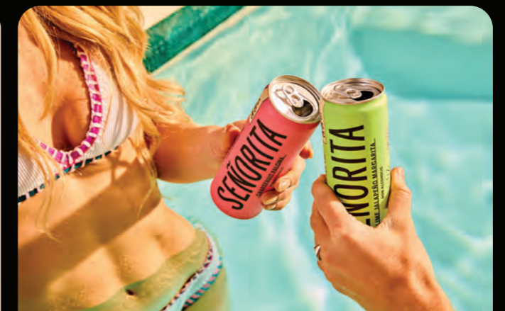
SEÑORITA THC MARGARITAS