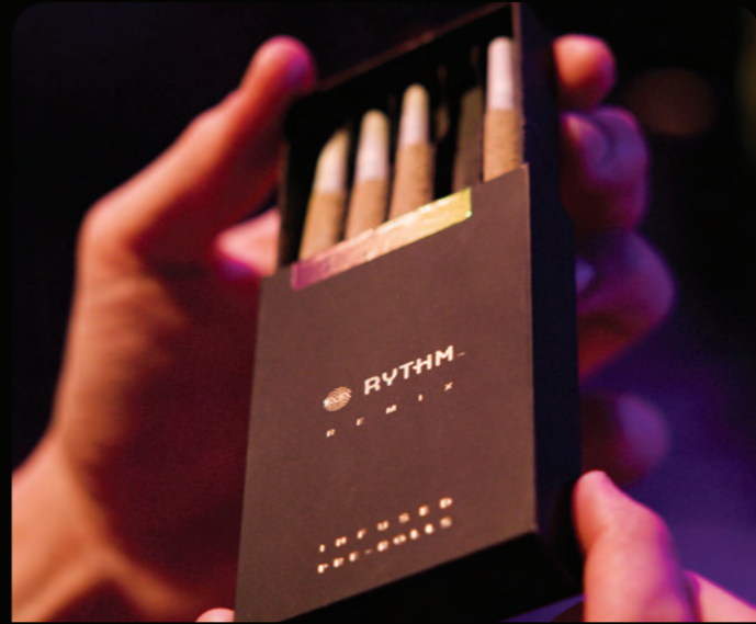
RYTHM REMIX PRE-ROLLS