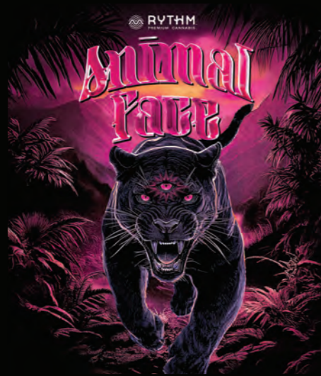
RYTHM'S ANIMAL FACE