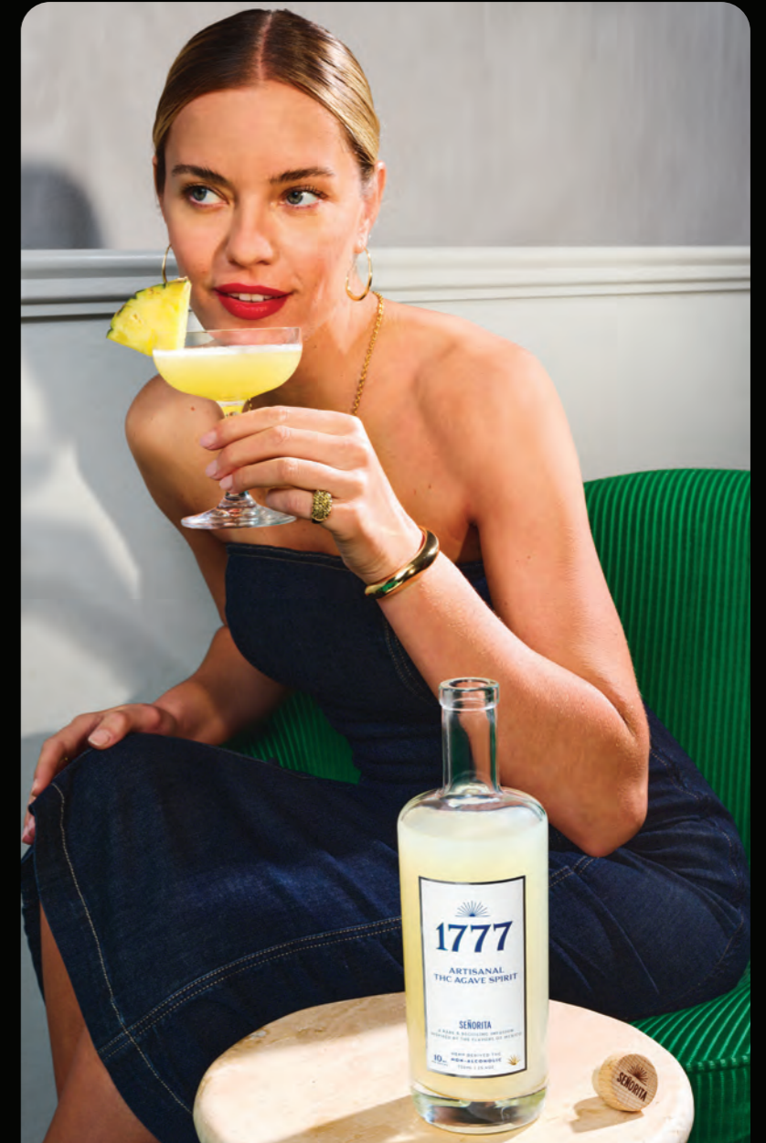
1777 BY SEÑORITA