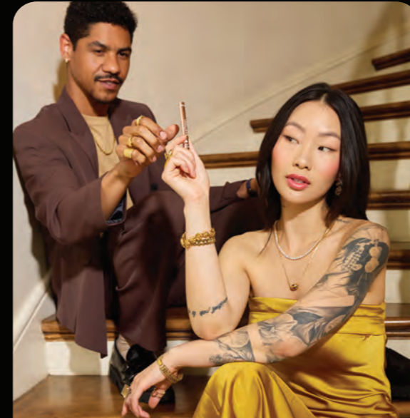
BEBOE INSPIRED VAPE PEN