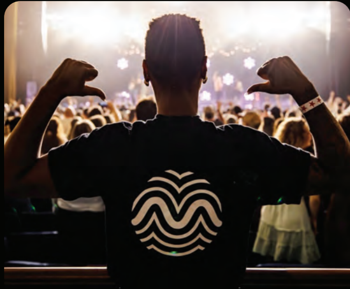
RYTHM BUD BALL